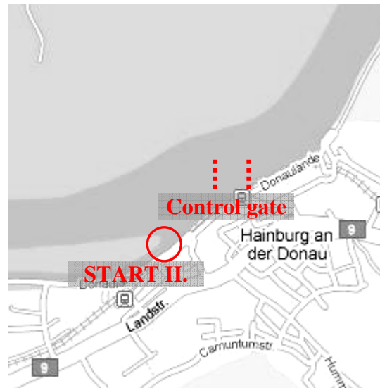
Hainburg – control point

Start I. 11.00 am all categories except Juniors and Tourists