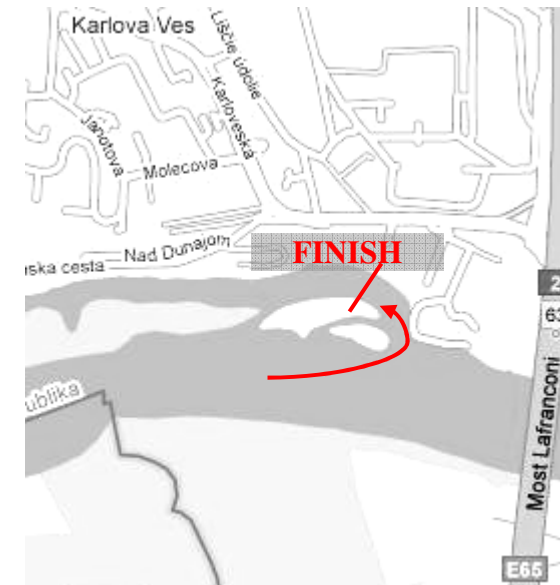
Bratislava – Karloveská creek

Start II 11.45 am only for Juniors and Tourists