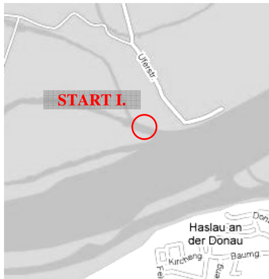
Orth an der Donau

Start I. 11.00 am all categories except Juniors and Tourists