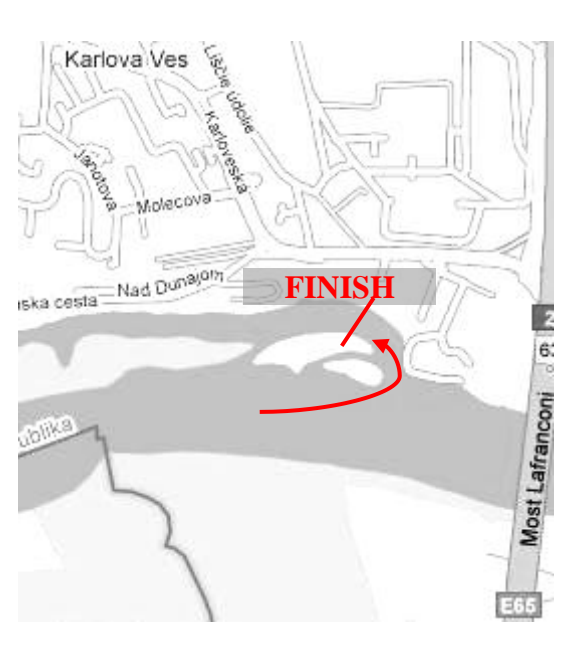
Bratislava – Karloveská zátoka