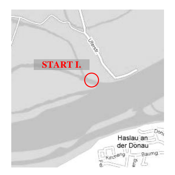
Orth an der Donau